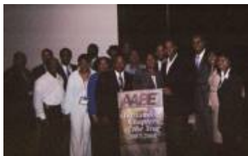
Atlanta's Outstanding Chapter of the Year Award (2007-2008)