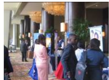
More Career Fair exhibits