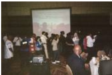
AABE Southeast Region Skit