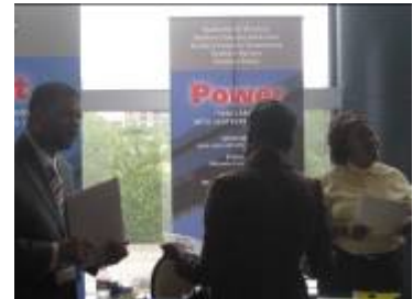
AABE members at the Southern Company Career Fair booth in Texas.