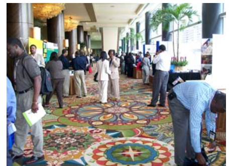
Career Fair & Expo