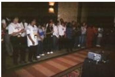
The Wiz – Orlando 2009 Skit